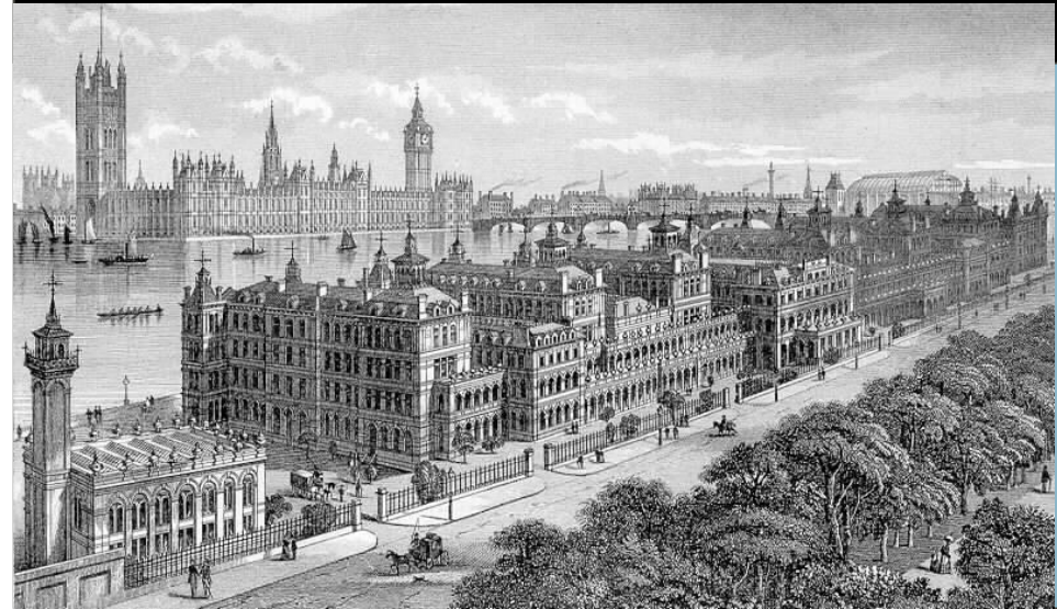
Guy's and St Thomas' Hospital

Located currently within St Thomas' Hospital, just off Westminster Bridge, the museum was opened in 1989 and now forms a key part of London's medical heritage. The collection consists of personal material associated with Florence Nightingale, items relating to the Crimean War, and nursing artefacts. The museum archives include approximately 800 letters from Florence Nightingale and an important rare book collection of 284 titles.